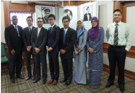
Reunion with Senegalese participants