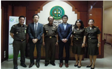
The Attorney General's Office (Indonesia)