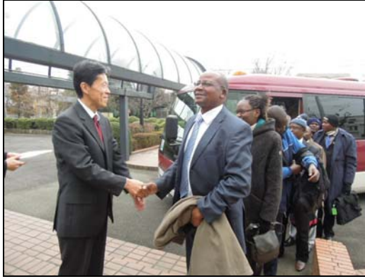
Participants' arrival at UNAFEI