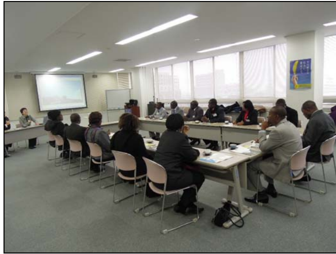
Observation Visit (Yokohama Probation office)