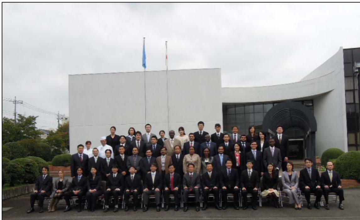
The 14th UNAFEI UNCAC Training Programme Group Photo