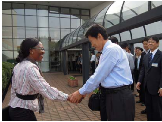
Participants' arrival at UNAFEI