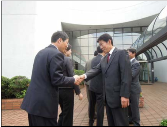
Participants' arrival at UNAFEI