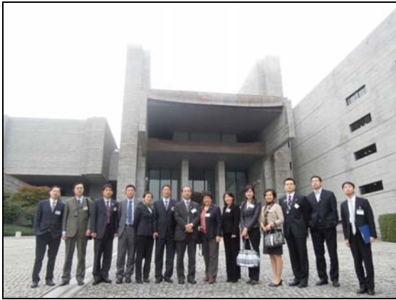
Visit to the Supreme Court