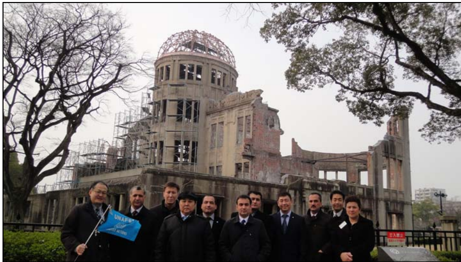
Study Tour (Hiroshima)