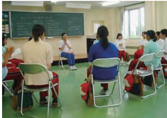
Group Work in a Juvenile Training School

Ordinary medical care is provided by the medical section of juvenile training schools. Juveniles in need of special medical care are treated in one of the two medical juvenile training schools. Juveniles can also receive treatment in hospitals outside of the school when necessary.