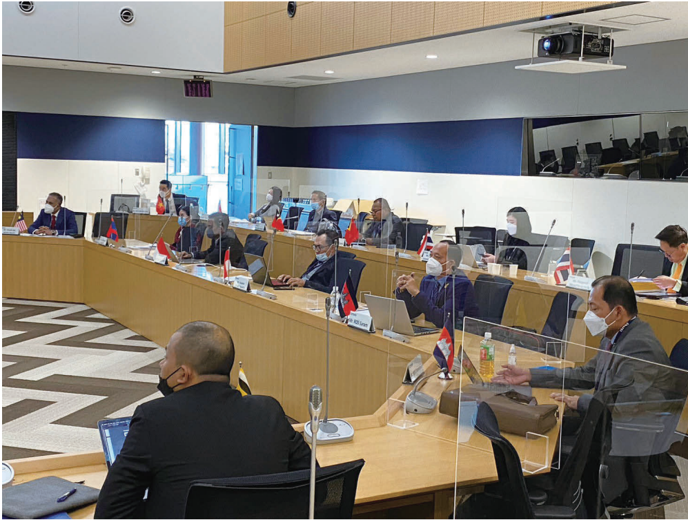
● The Seminar (Participants)