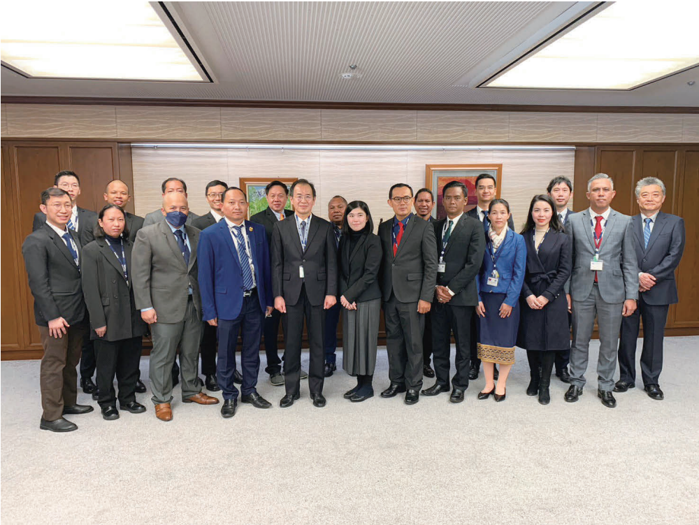
● Visit to the Vice Minister of Justice