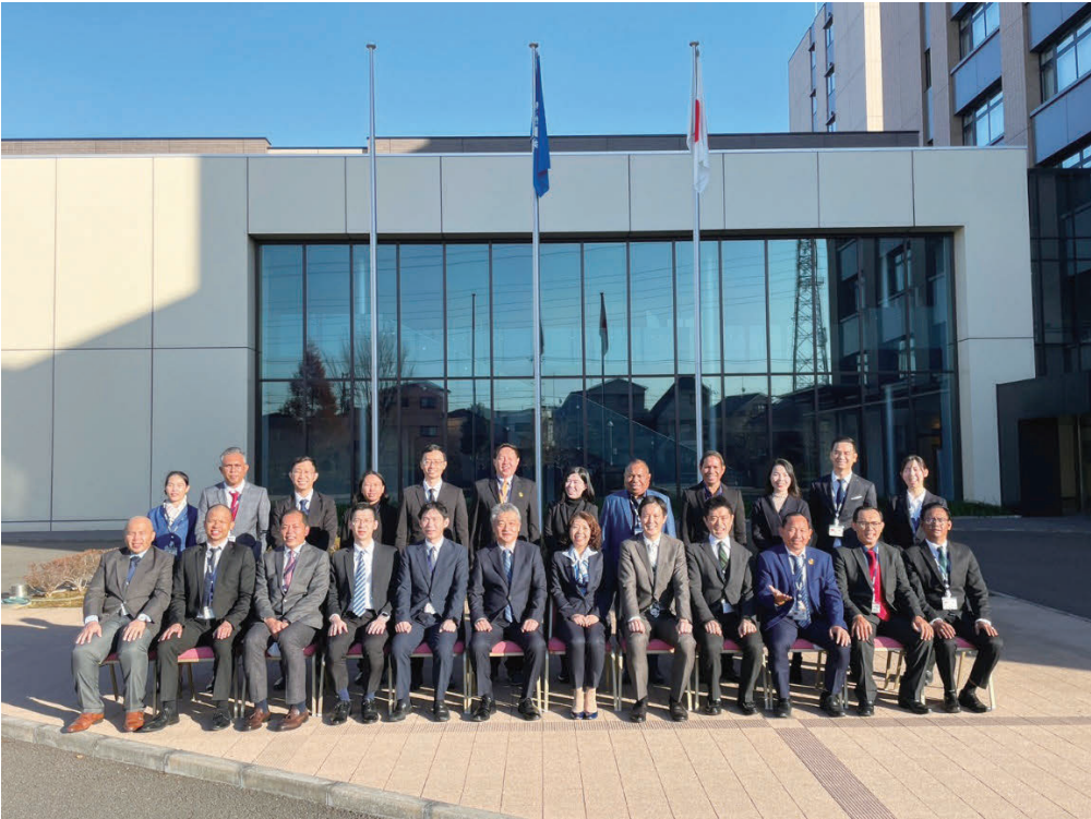
● Group Photo in Front of UNAFEI