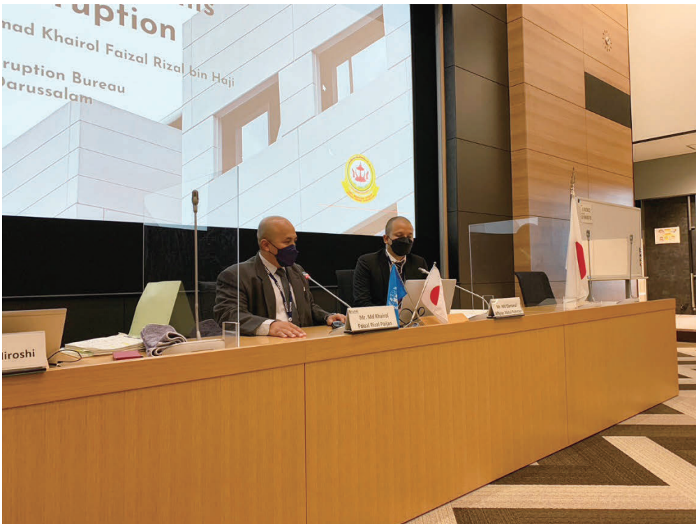
● Presentation by Participants