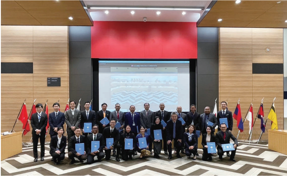
● Closing Ceremony