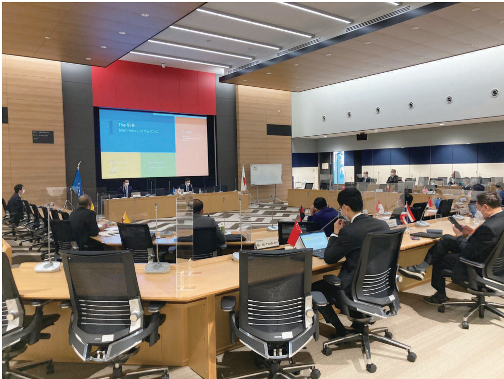
● The Seminar (Presentation)