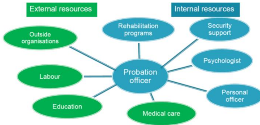
Figure 1: Interagency cooperation in Estonian prisons

whether early release is feasible and, if so, about the conditions that should be attached. For some offenders a halfway house may offer a gradual transition from prison to the community.