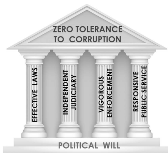
Diagram A. Singapore's corruption control framework

Singapore's strategy on anti-corruption can be illustrated through diagram A, which consists of four pillars of corruption control, underpinned by strong political will.